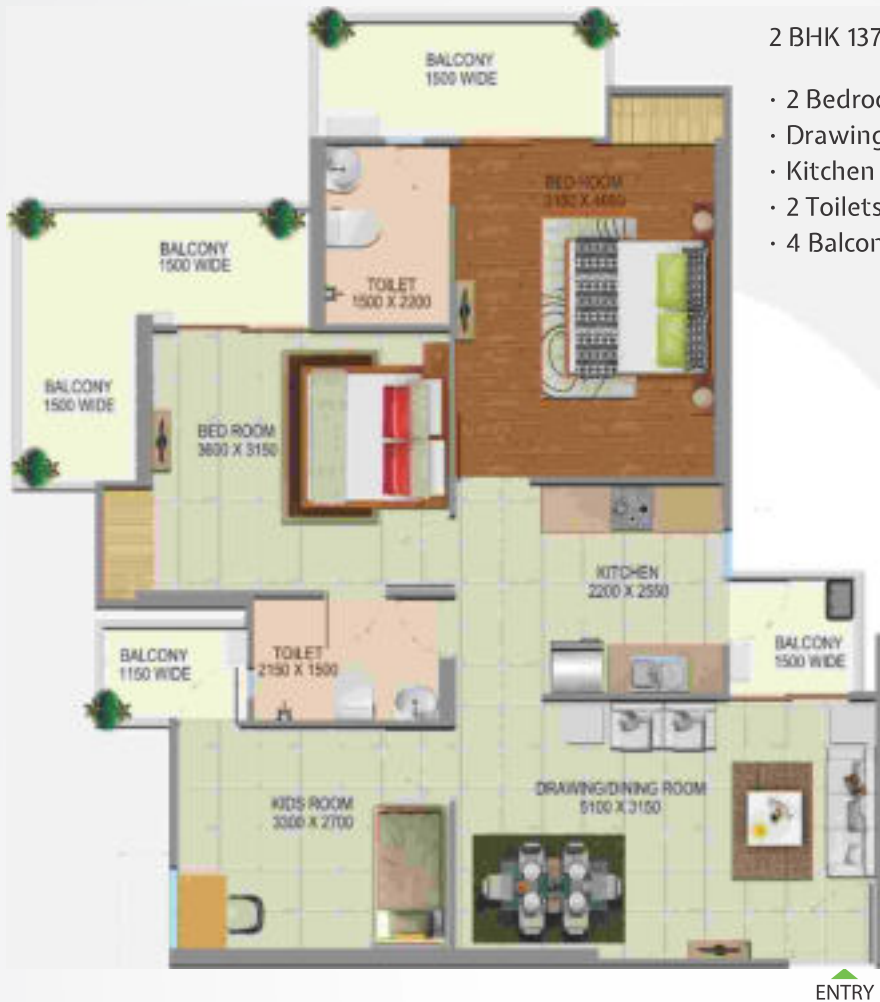
2 BHK 1375 Sq. Ft.