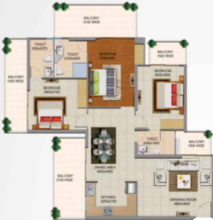
3 BHK 2025 Sq.Ft.